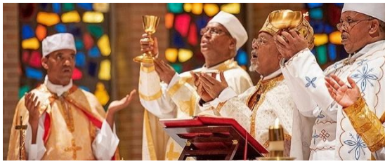
THE ALEXANDRIAN RITE

The Ethiopian Catholic Church is an autonomous Eastern Catholic Church, based in Ethiopia, which uses the Alexandrian Rite in Ge'ez (a local liturgical language).